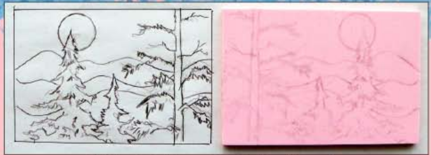
Original sketch and hand rubbed transfer of drawing to Speedy Carve™

1. Students will create an original pencil sketch drawn to the exact size of the plate material. Subject matter can include (but is not limited to) landscape, seascape, portrait, still life, architecture, nature, etc.