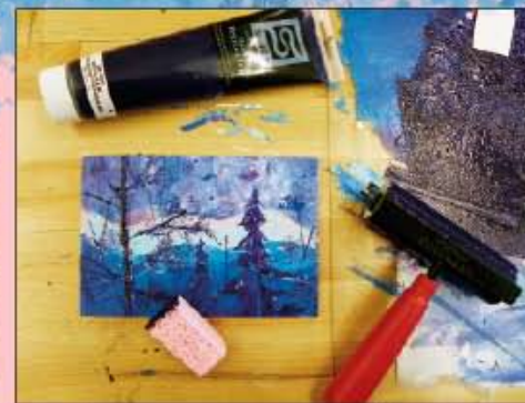
Dry sponges pressed into ink to add leaf texture