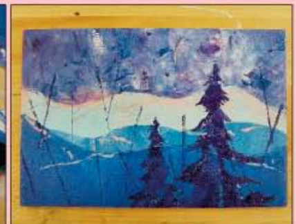
Stencil trees with rollers or brushes

7. Stencils are a very effective method for adding hard-edged shapes to the monotype. Use heavy tracing paper to trace the shapes from the original sketch. Cut out the stencil shapes with an X-ACTO® knife on a cutting mat or heavy cardboard prior to inking the plate.