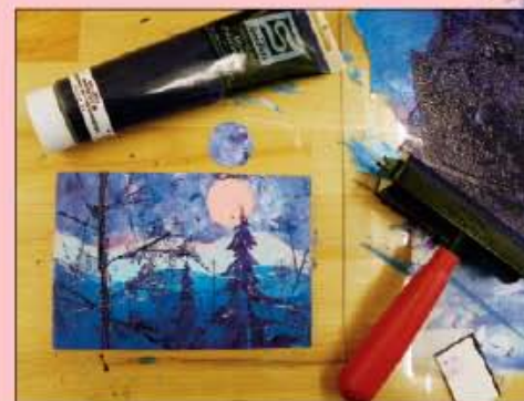
Masking tape frisket removed prior to printing