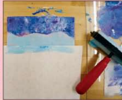
Light blue rolled over a paper mask