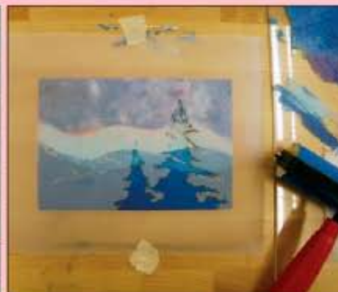
Position stencil over plate and tape in place