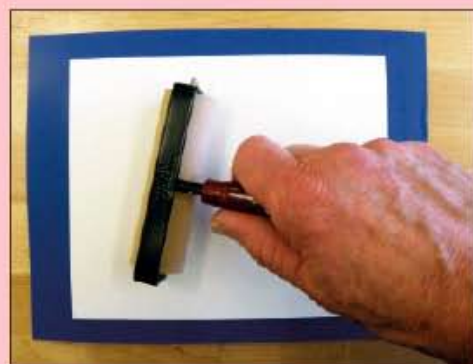
Roller used to transfer print