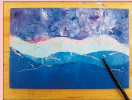
Subtract wet ink with sticks to create lines

6. Additive methods of applying inks to plates include rollers, brushes, mat board, sponges, wooden shapes, and inked textures.