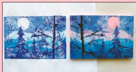
Final print with plate showing remaining ink residue, suitable for a ghost print