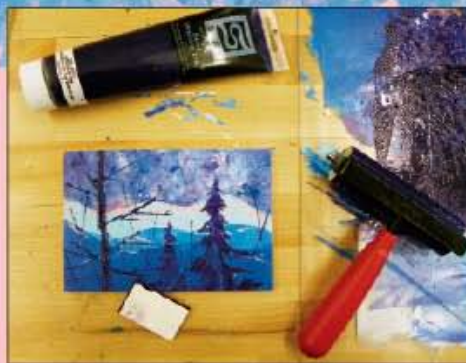
Tree created with mat board edges pressed into ink