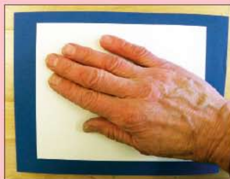
Hand pressure to transfer print