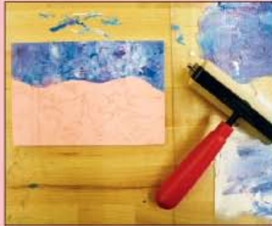
Multiple inks mixed with brayer to create sky