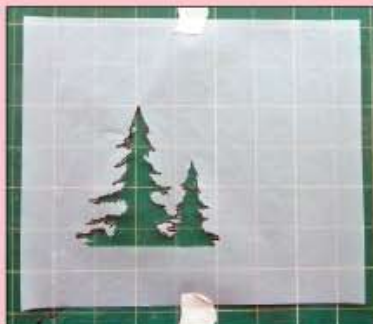
Cut stencil on cutting mat