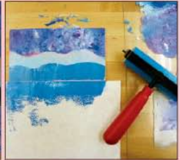
Medium blue rolled over a paper mask

3. Masking tape friskets can be applied prior to inking, thus preserving areas of the print image that need to remain white. The tape will be removed prior to making the final print.