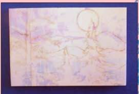
Washed plate showing original sketch and slight staining