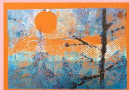
Ghost monotype print on colored paper