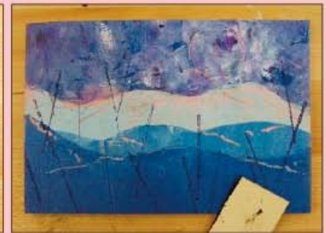
Add lines by pressing matboard edges into wet ink