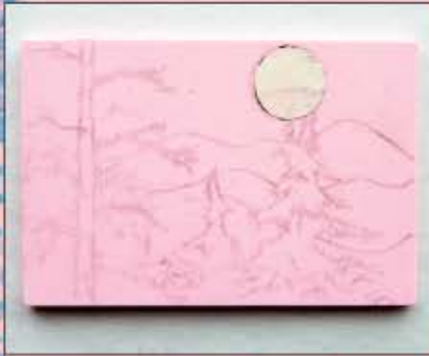
Masking tape frisket on circular shape

2. Transfer the drawing to Speedball® Speedy Carve™ using a burnisher or hand rub. The graphite should transfer to the plate material. If using a Speedball® POLYPRINT printing plate, the drawing can be traced lightly with pencil, however, a relief line might be present in the POLYPRINT material. This may be advantageous for the younger artist, as a white line will be present throughout the application of inks and will appear as a white line in the final print.