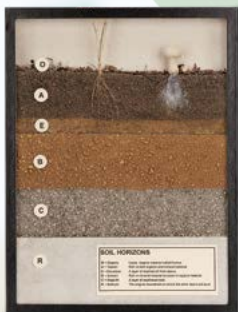
Crop Identification Kit – C34457