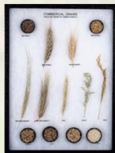
Commercial Grains – C19940