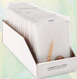
Commercial Crops Identification Mounts Series – C25046