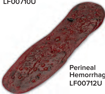
Perineal Hemorrhage LF00712U