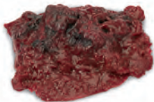
Small Blood Clot LF00710U