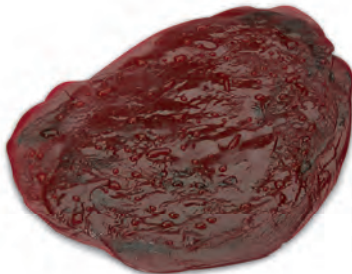
Hemorrhage Blood Pool LF00713U