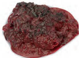
Large Blood Clot LF00711U